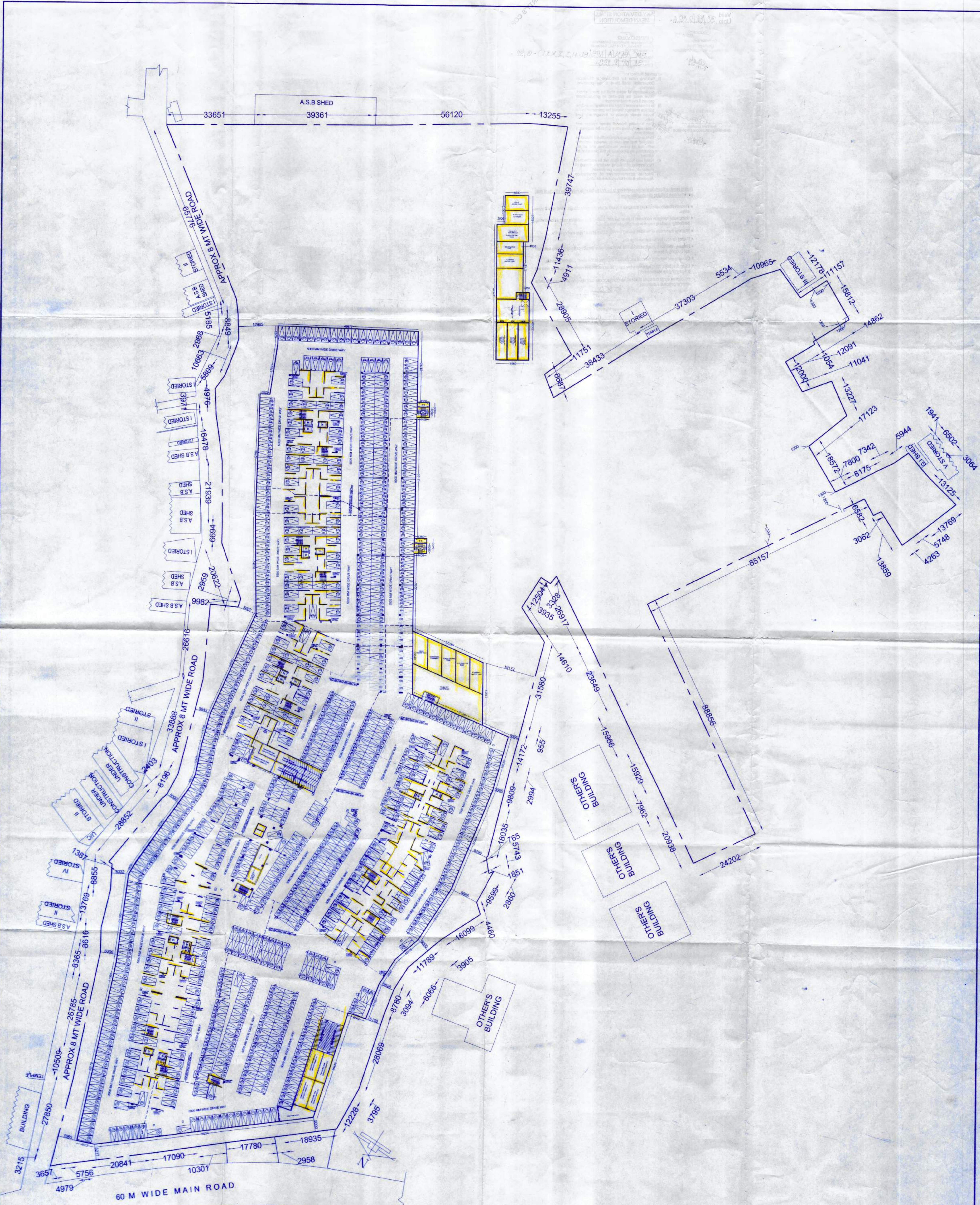
BASEMENT PLAN SCALE-1:400

CERTIFIED THAT I HAVE GONE THROUGH THE WEST BENGAL MUNICIPAL BUILDING RULES 2007 AND ALSO UNDERTAKE TO ABIDE BY THOSE RULES DURING AND AFTER THE CONSTRUCTION OF THE BUILDING. [List of professional registrations and signatures] Signature of Owner Signature of Structural Engineer